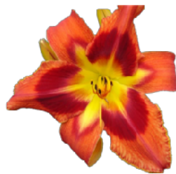
'Carnival In Caracas' daylily (Santa Lucia 2007)

Beautiful blooming daylilies were once again on display at the Upper Arlington Library, 2800 Tremont Rd., Upper Arlington, Ohio during the 2023 MCDS flower show on this past Saturday, June 24, 2023. The theme "The Greatest Show on Earth" featured a tribute to the 'Carnival In Caracas' daylily (Santa Lucia 2007)